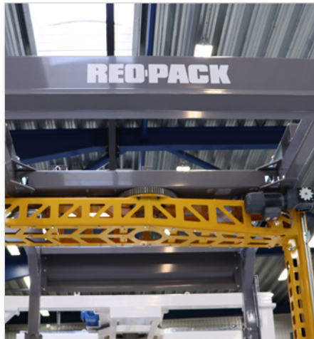
Swingarm and wheel ball bearing