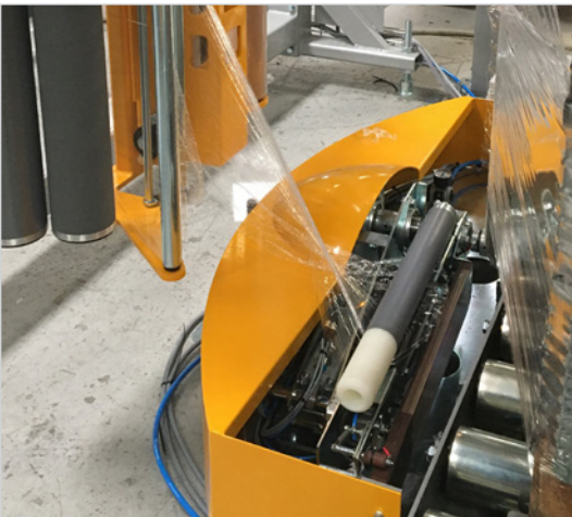
ISS welding module